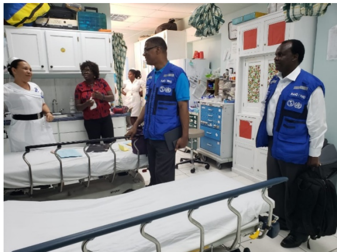
Tour of the Emergency Room of the Bequia Hospital in St. Vincent and the Grenadines