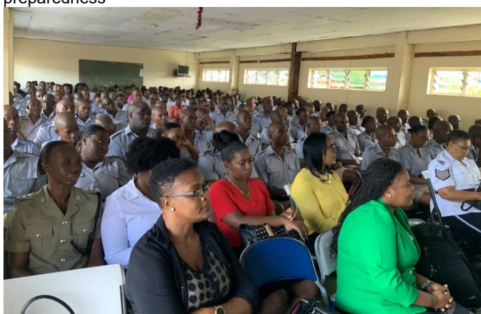
Cross-section of the St. Vincent and the Grenadines Police Officers at the Sensitization and education session