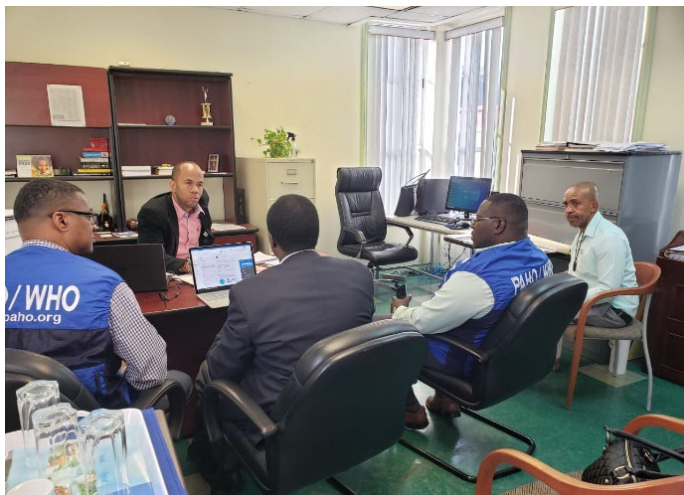
Meeting with the Minister of Health, Wellness and the Environment, Hon Luke Browne

Here is the PAHO team on a recent visit to St Vincent and the Grenadines.