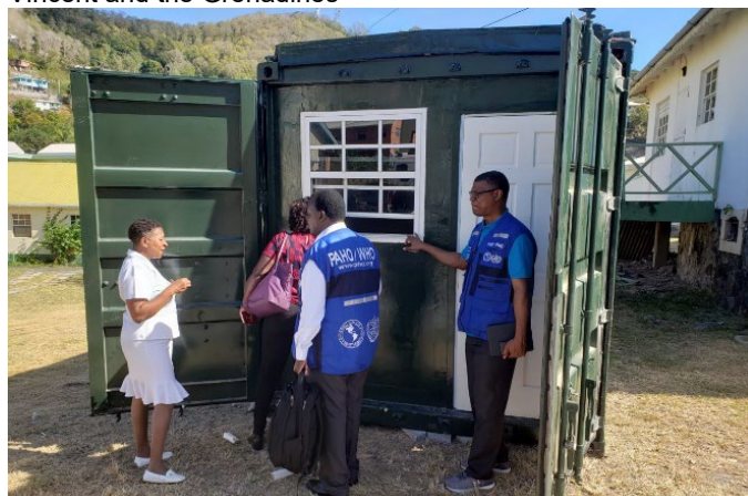
Inspects an COVID-19 triaging station at the Bequia Hospital